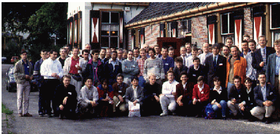
Figure 3. Attendants of the first international Scale-Space conference, Summer 1997 in Utrecht, the Netherlands, chaired by the author (standing fourth from right).

This book is written for both the computer vision scientist with an interest in multi-scale approaches to image processing, and for the neuroscientist with an appeal for mathematical modeling of the early stages of the visual system. One of the purposes of this book is to bridge the gap between both worlds. To accommodate a wide readership, both from physics and biology, sometimes mathematical rigor is lacking (but can be found in the indicated references) in favor of clarity of the exposition.